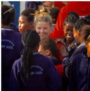
Build a hostel at Kutenhoas